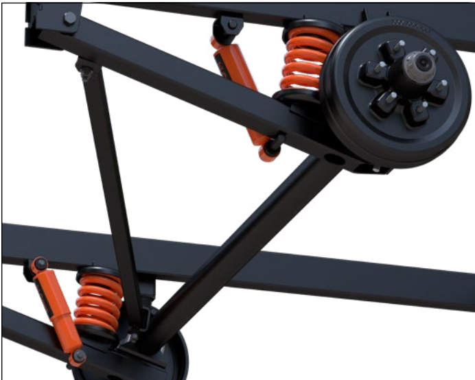
Trailing arm style suspension with coil springs and shock absorbers